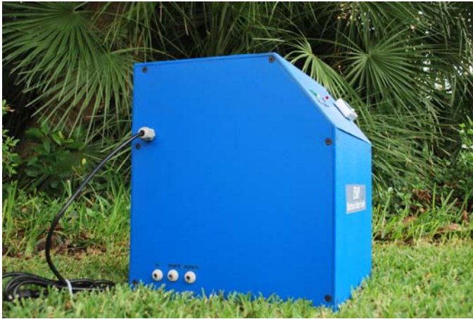
Side view (all connections come out this side)